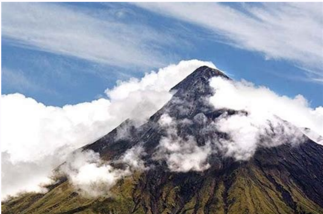
Mayon Resthouse 2019/03/07 17:53:18